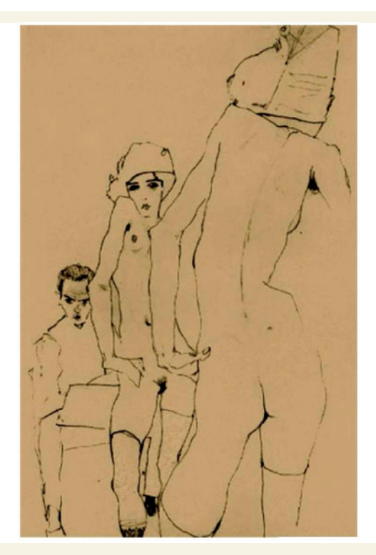
Figure 3 Egon Schiele, 'Nude in front of the mirror' (1910). Pencil on paper. 'By covering parts of the body that are not usually considered necessary to cover, Schiele emphasises those that are uncovered. Moreover, the models posture is a perfect caricature: it exaggerates one aspect a woman's body that is inherently erotic, her hip. The hips of Schiele's model are brilliantly drawn. By placing her before a mirror he is also, indirectly, drawing her nude body from the front and depicting himself sketching her. Seen in the mirror, it is unclear whether the woman is unself-consciously posing for the artist or whether she is engaging in seduction. Schiele's gaze is voyeuristic but the model seems oblivious to his intensity and playfully poses while looking at herself in the mirror. Schiele uses a mirror to express his interest in the direct and indirect image, the outward appearance and the private theatre of the mind, the demure and the sensual'. (p. 402).

the content of our sensorium but also the context , in terms of the precision or certainty about the content. This represents a subtle but ubiquitous problem that the brain has to solve—and the solution rests on modulating the gain or post-synaptic sensitivity of neuronal populations encoding prediction error.