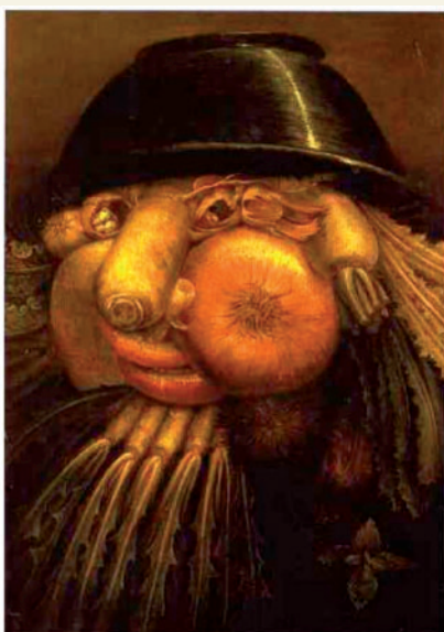
Figure 2 Giuseppe Arcimboldo, The Vegetable Gardener (c.1590). Oil on panel. Our percepts are constrained by what we expect to see and the portfolio of hypotheses that can be called upon to explain sensory impressions (Gregory, 1968). As Ernst Gombrich (1909–2001) predicted, only specific (predictable) stimuli can 'pick the locks on the neural gateways to vision.' (p. 254). Guiseppe Arcimboldo (1527– 93), 'a 16th century Milanese artist who was a favourite of the Viennese, illustrates this dramatically by using fruits and vegetables to create faces in his paintings. When viewed right side up, the paintings are readily recognisable faces' (p. 288).

first introduced as an explanation for retinal processing (Srinivasan et al., 1982). It did strike me that the detour from unconscious inference (Helmholtz, 1866/1962) to conscious inference (as considered by Kandel) was based on the seminal work of several visual neuroscientists from the eastern seaboard of Americawhere Kandel has worked since 1952.